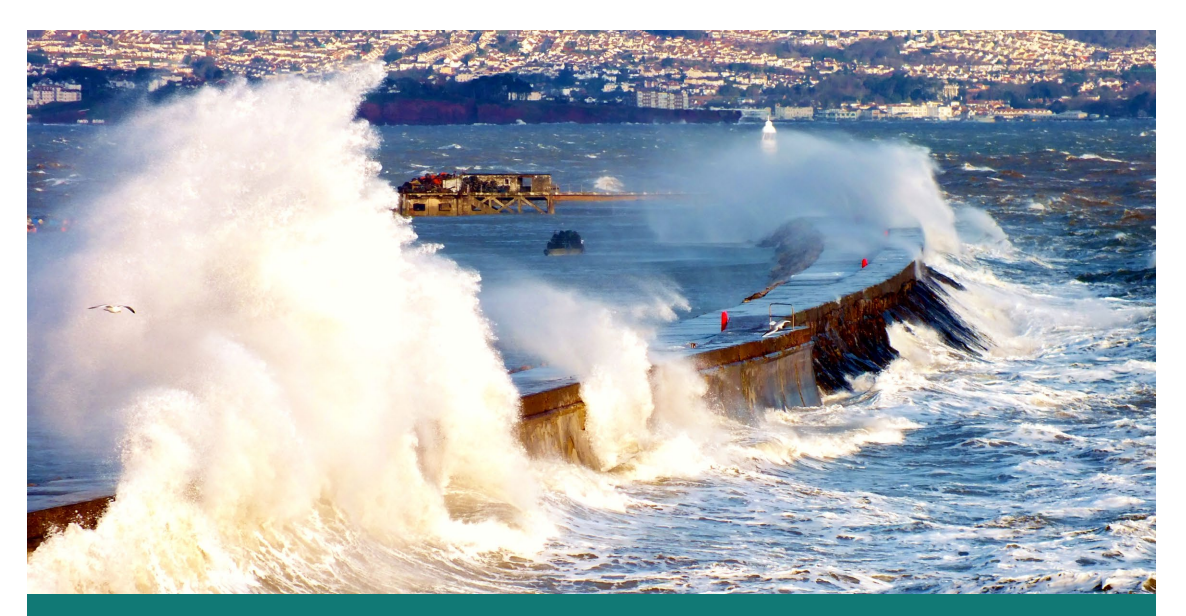
Call for input, information and expertise

The Defra Ocean Climate Team are currently undertaking an evidence synthesis to map out UK based projects that have taken place on the theme of marine climate change. As part of this, projects relating to the topic of 'People and the Sea' are of interest and being included. This review will help to better understand current